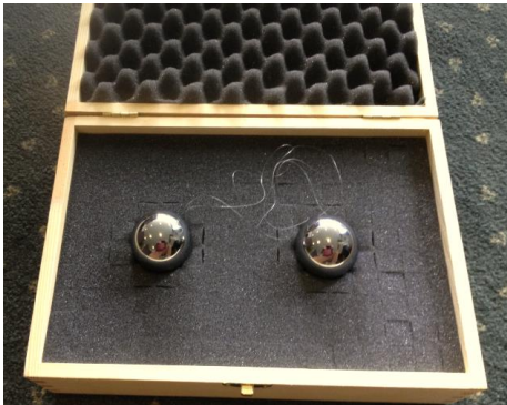
Name of the ship on the packing case